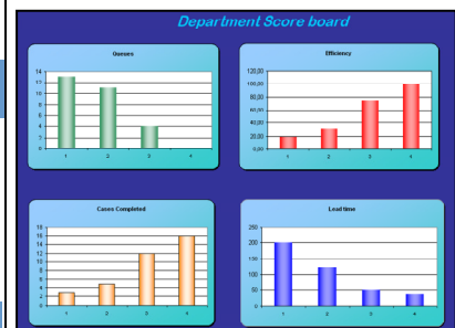
The graphs in the Excel performance monitor